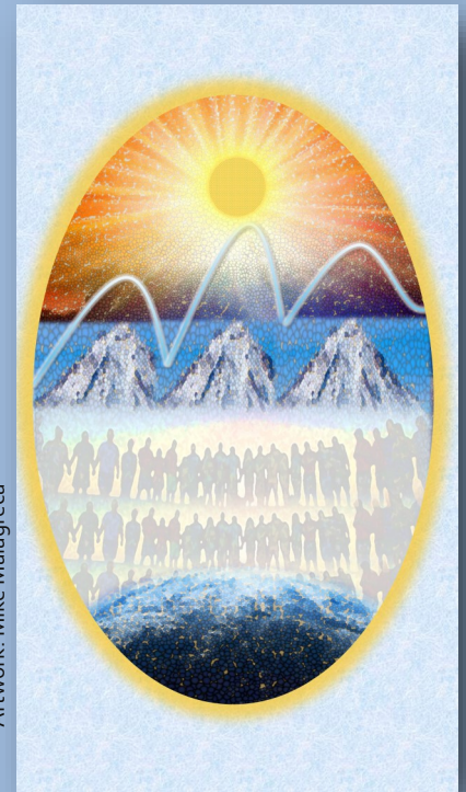
Artwork: Mike Malagrecia

Each year, during the period of the full moon festivals known as the Three Linked Festivals (the Easter Festival at the Aries full moon, the Wesak Festival at the Taurus full moon, the Festival of Goodwill at the Gemini full moon), our School holds its Subjective Group Conference. Beginning two days before the Easter Festival and ending two days after the Festival of Goodwill, all participants join in unified study and meditation focused on some aspect of the Plan in order to aid in its precipitation on Earth. We request a $20 participation fee from those participants who have not donated anything in the past year to support the School's mission.